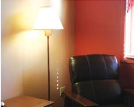
Floor Lamp FL808