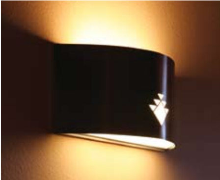
Bed Light - Two - Circuit Up & Down