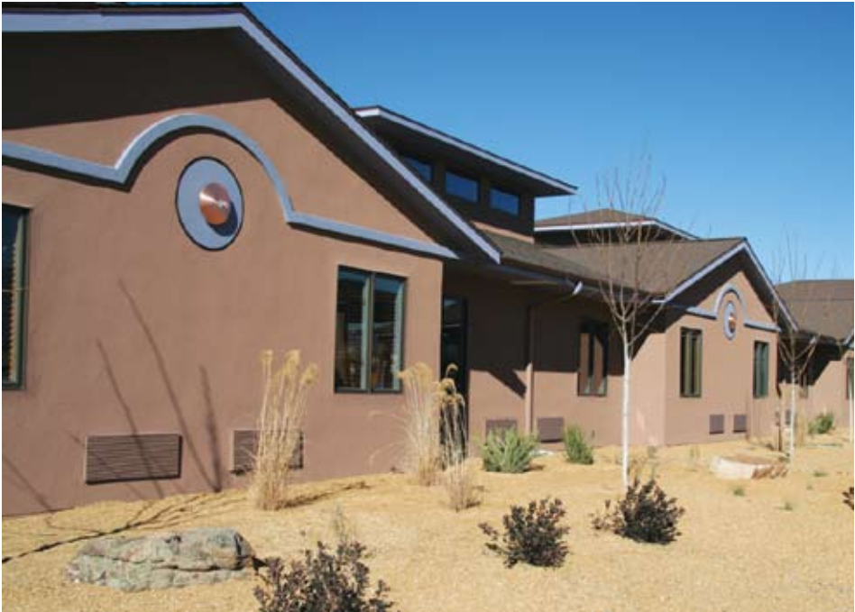
Advanced Healthcare, Albuquerque, NM