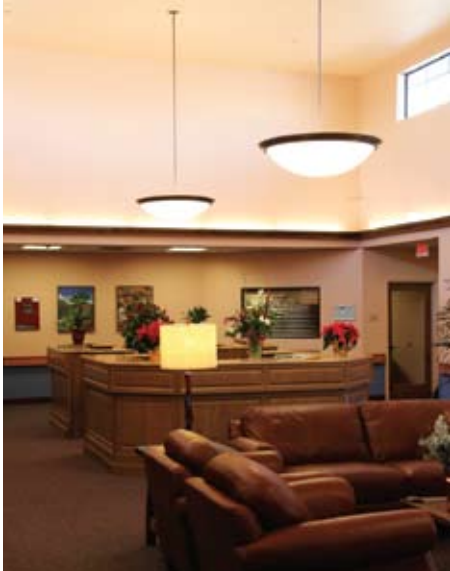
Entrance Lounge 322-41