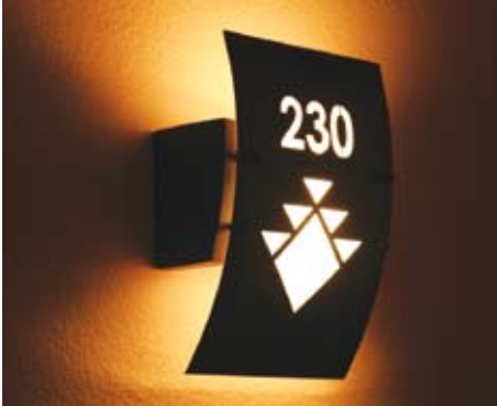
Room # Sconce M552