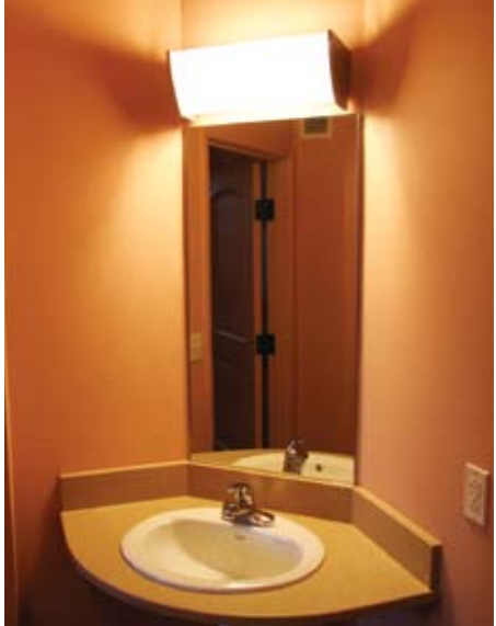
Patient Bathroom 572-18